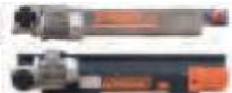
Versione disponibile anche in ferro e acciaio inox

Available accessories Accessori disponibili pg. 28