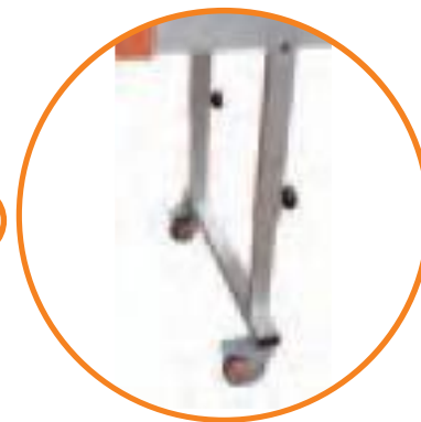
Detail: standard flat leg Particolare: gamba flat standard