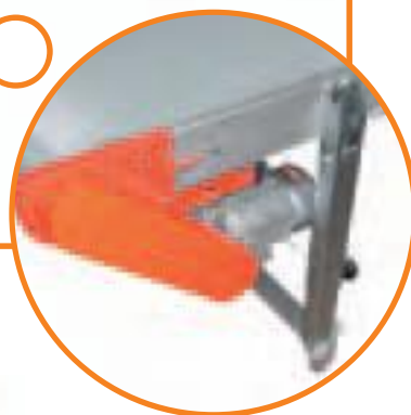
Option: Motor placed under conveyor Alternativa: Motore sotto nastro con rinvio a catena